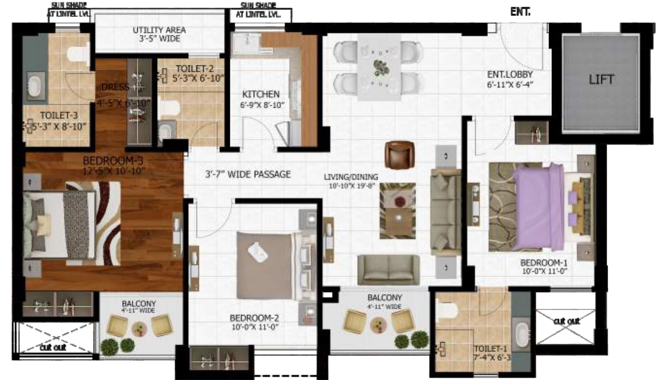
Unit - 01