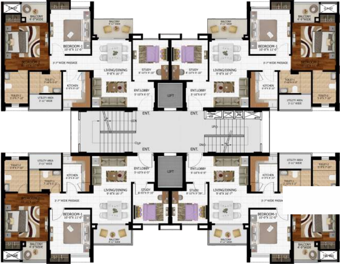
Unit - 03