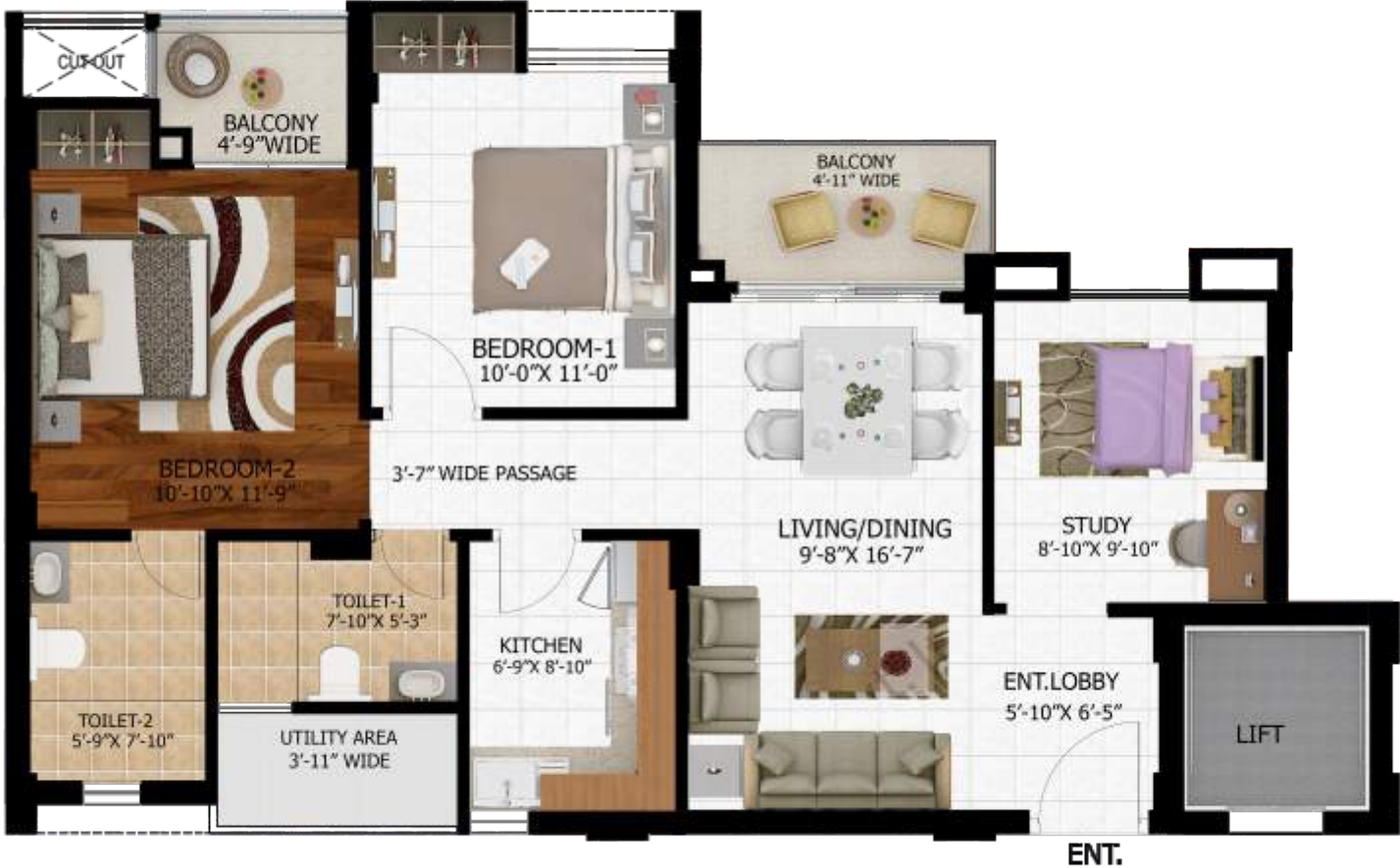
Unit - 02